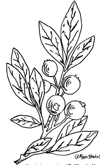
Vaccinium ovatum (California Huckleberry)

John Muir had an abiding passion for California's native flora. We hope to inspire that same passion in those who "saunter" through the garden. Enjoy and take the time to learn the names and growing conditions of some of the state's most beautiful trees, shrubs, perennials, and grasses.