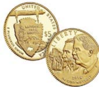
Commemorative coins celebrating the NPS Centennial are now available. One of the designs features profiles of John Muir and Teddy Roosevelt with Yosemite’s Half Dome. The National Park Service logo is on the reverse. The $5 gold proof coin sells for $400.45 at www.usmint.gov .

and restoration afterward. Environmental, as well as historic, education about the creek is part of KCCB’s educational program. Monthly events are planned, to which a multitude of volunteers has responded. Partner organizations include dozens of South Bay high schools, San Jose State University students and faculty, De Anza College faculty, the Coyote Creek neighborhood association, Berryessa Citizens Advisory Council, US Marine Corps, and the Downtown Streets Team. Watershed tours and organizations offering expertise and organization significantly expand the active partnerships.