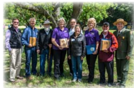
2013 John Muir Conservation Award Recipients John Muir–Birthday Earth Day Celebration