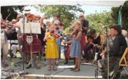
Members of the San Francisco Scottish Fiddlers entertain (above) and a young guest paints a beaver tail (right).

The natural kinship between conservation and beaver habitat was celebrated at Worth A Dam’s seventh annual Beaver Festival in downtown Martinez on August 2nd. The John Muir Association (JMA) was proud to be among 45 wildlife and conservation organizations with wonderful booth displays and activities.