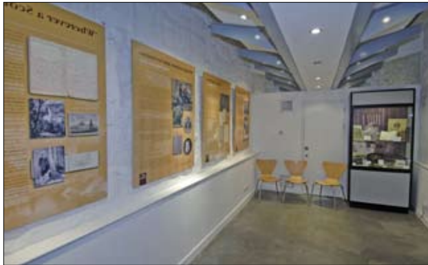
An exhibition to celebrate Year of the Homecoming at John Muir's Birthplace.

The small 18th century town house was converted into a 21st century interpretative centre telling the story of Muir's life and legacy. It opened