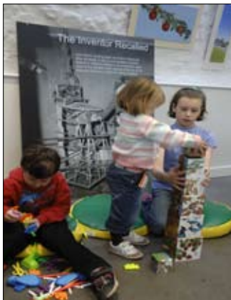
A drop-in workshop at John Muir's Birthplace.

The use of modern technology allows hands-on experiences for all ages and is particularly attractive to young people. Technology also dramatically increases the amount of information which can be presented. The house's small garden is now an education/